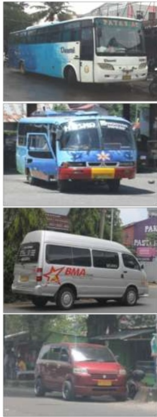
Figure1. Vehicle types of AKDP-transport, DAMRI, Mini Bus, BMA and MPU (top to bottom)